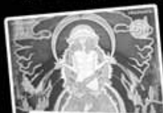
Space Ritual HAWKWIND 1973

As a great reference point to what this mini-fest is all about, here are 5 essential LPs that sum up the embodiment of Ottawa Psychfest...please enjoy and come out to see