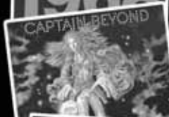
Captain Beyond CAPTAIN BEYOND 1972