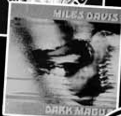
Dark Magus MILES DAVIS 1977

BIRDMAN SOUND NOT YOUR DAD'S SHITTY RECORDS SINCE 1991 593 Bank St, Ottawa