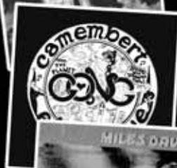
Camembert Electrique GONG 1971