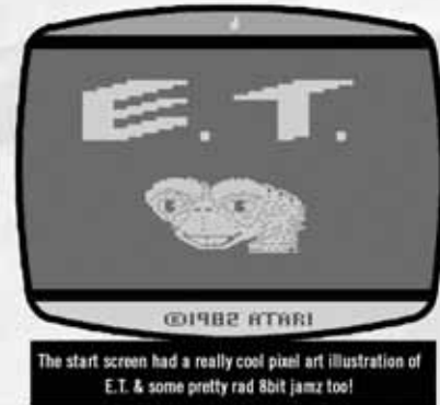
The start screen had a really cool pixel art illustration of E.T. & some pretty rad 8bit jamz too!

THIS MONTH MARKS THE 35th ANNIVERSARY OF THE INFAMOUS E.T. THE EXTRA-TERRESTRIAL CARTRIDGE RELEASE FOR THE ATARI 2600, REGARDED BY MANY AS THE WORST VIDEO GAME EVER MADE. A QUICK GOOGLE SEARCH SUPPORTS THIS RATHER POPULAR OPINION BUT WAS THE GAME REALLY THAT BAD OR IS ALL THIS VITRIOLIC "JOURNALISM" SIMPLY THE PRODUCT OF "GENIUS" BLOGGERS TRYING TO GET ATTENTION IN THEIR LITTLE CORNER OF THE WEB?