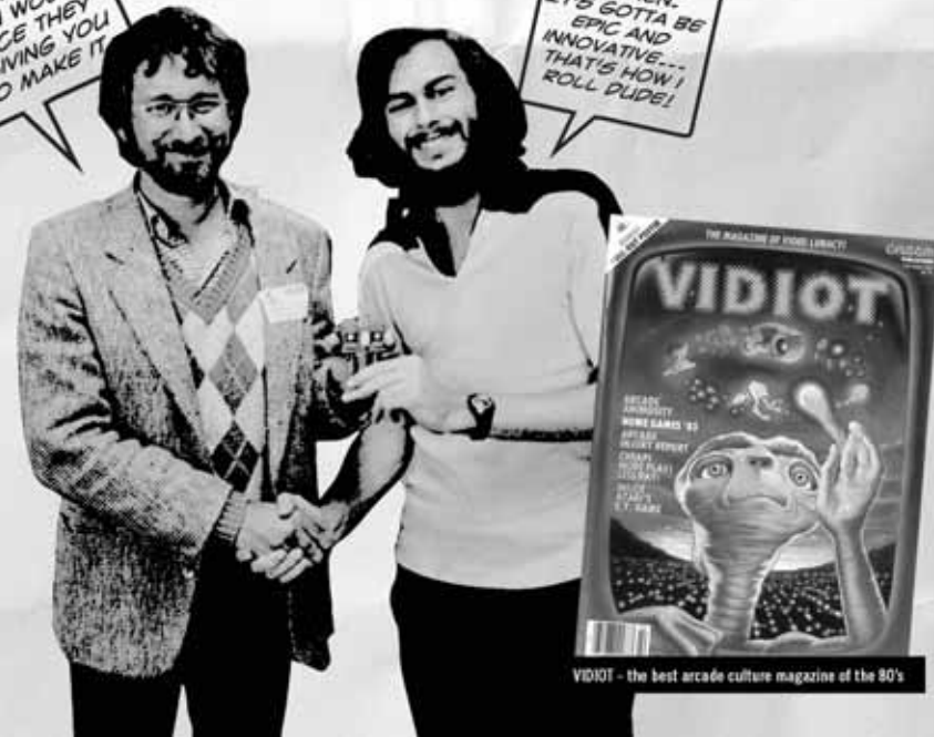
VIDIOT - the best arcade culture magazine of the 80's