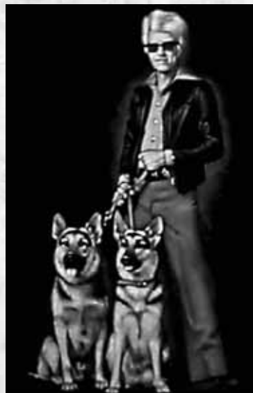
The Real Heino immortalized in a rad velvet painting.