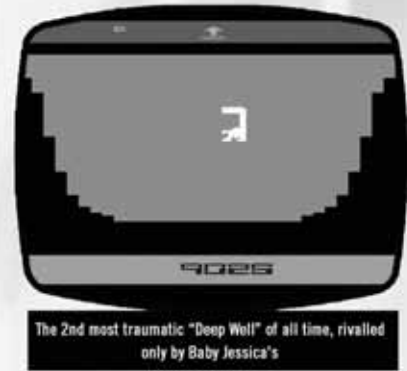
The 2nd most traumatic "Deep Well" of all time, rivalled only by Baby Jessica's

There are plenty of emulated versions of E.T. online to try for yourself. Only then can you determine if you are one of the many haters or if you can find beauty in this "ugly duckling" & become inspired by a creative endeavour governed by the imperative to NEVER GIVE UP.